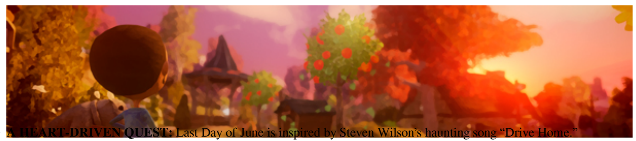
Recreated as an interactive adventure, Last Day of June takes players on a profound and poignant journey.